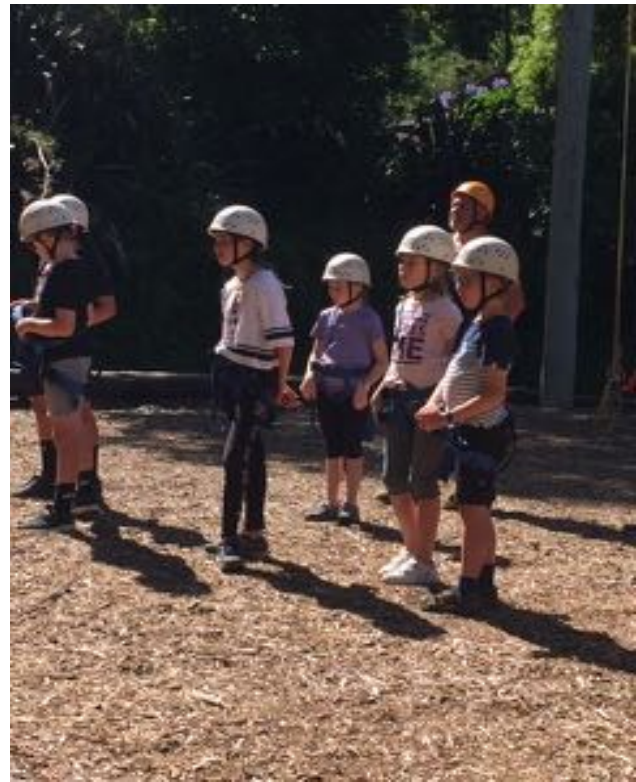
Preparing for the High Ropes

Thank you to the parents and teachers who have supported these camps this week. I wish you a restful weekend!