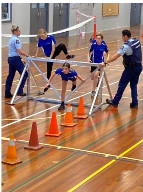
Recent PCT competition